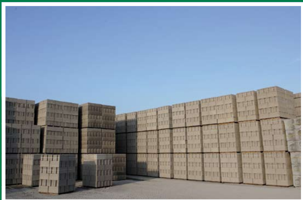
View of finished blocks