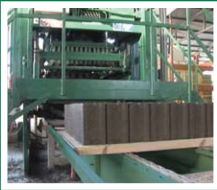
Extraction of blocks