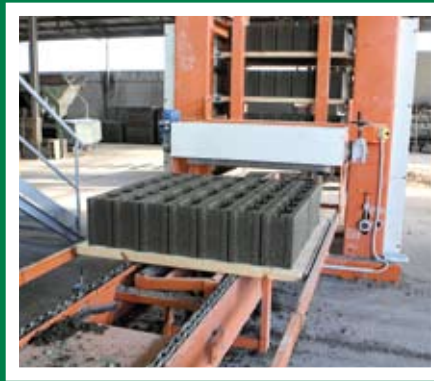
Elevator and brush