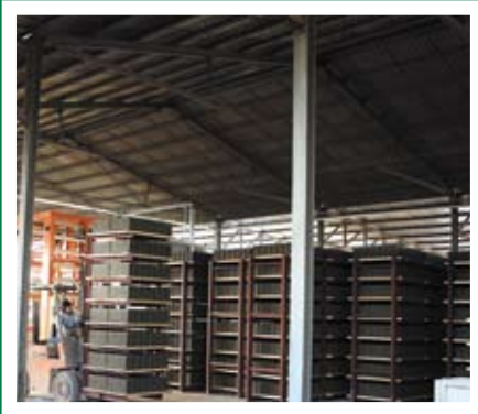
From elevator to stock